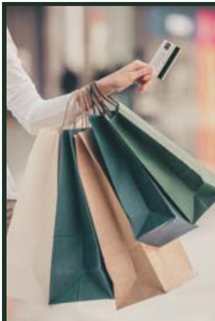
BOUTIQUES & SHOPS