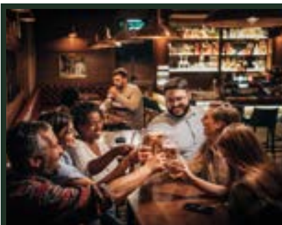
RESTAURANTS, PUBS & CAFES