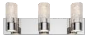
BATHROOM VANITY LIGHT