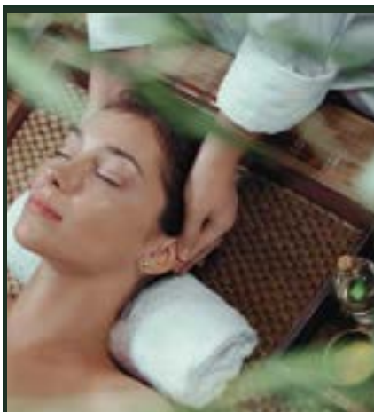
SPAS & SALONS