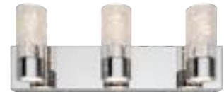
BATHROOM VANITY LIGHT