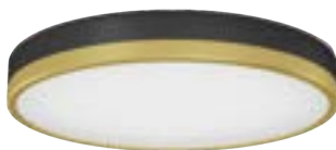
PRIMARY BEDROOM LIGHT